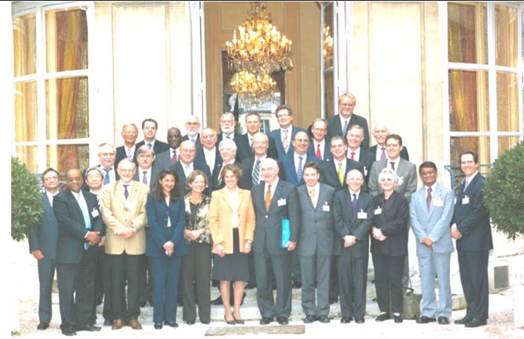
Better Aid for Access to Finance Meeting 2006, Paris

Eighteen development agencies participated in SmartAid to date.