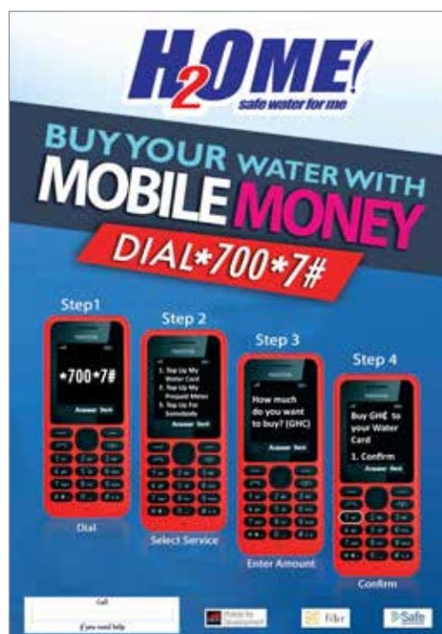
FIGURE 3: A flyer promoting mobile payment for water in Ghana

In non-African contexts, the rapid proliferation of digital payment options makes this an interesting time to pursue integration. Different WSS providers reported both a lack of or too many digital payment options. In Bangladesh, Drinkwell had to choose between Bkash, Rocket, and traditional bank agents, with penetration and cost being its main considerations.