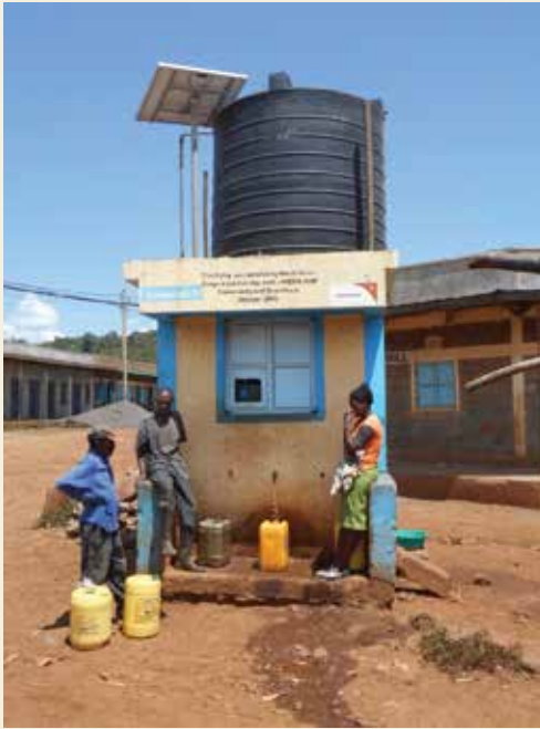
FIGURE B4-1: A Grundfos Lifelink kiosk in rural Kenya

In six out of seven Grundfos locations surveyed, mobile money was the only mode of payment for water. Even in Kenya, where M-PESA is omnipresent and 73 percent of adults have a mobile money account, WSS providers are driving increased use. Thirty-five percent of interviewed customers made their first mobile bill payment at LifeLink ATMs; users who had previously used only mobile money for remittances or airtime top-ups are now paying for other services, such as school fees, on their phones. Much of this was driven by value: Lifelink water is cleaner and cheaper than water sold by private sellers, and customers are now tracking and optimizing their water spend in ways they could not before digitization.