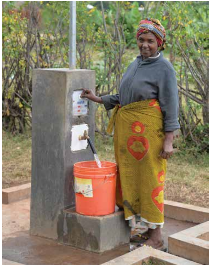
FIGURE 2: A Woman using a water ATM in rural Gambia

All in all, cash plus card is a significant improvement on cash. It can exist in parallel with a fully digital top-up option, and it serves as a useful bridge to fully digital collections, particularly in places where users are unaccustomed to initiating payments.