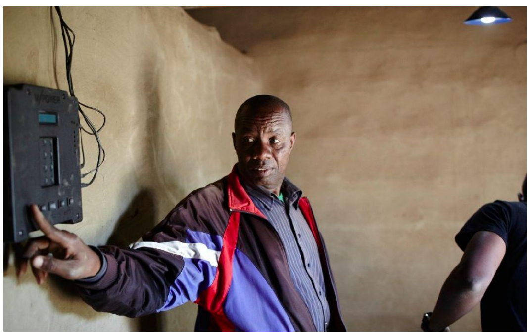
Off-Network PAYG Hardware - Off-Grid:Electric, Tanzania

The majority of current PAYG solar products on the market today use off-network hardware. Most PAYG solar products deploying off-network hardware typically include an embedded microcontroller with one or more electrical switches to enable/disable usage based on entry of a valid 10–12 digit "unlock/usage" code that customers manually enter into the device through a product-integrated keypad (Azuri Technologies, Off-Grid:Electric, Quetsol, Simpa Networks, Sun Transfer) or a handheld remote control unit with short-range infrared (Fenix International, Lumeter).