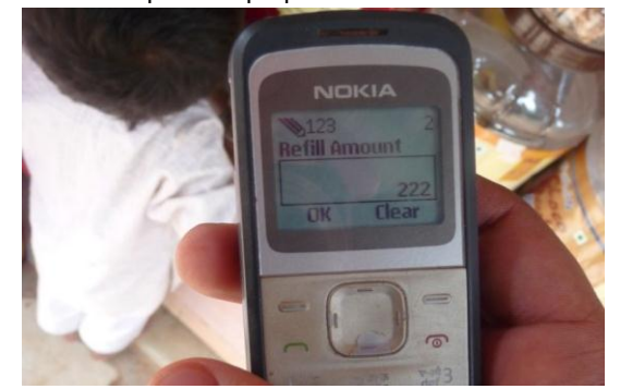
Simpa Easy Recharge (Simpa Networks, Inc.)

Simpa Networks (India) also sells prepaid energy credits through appointed agents, but deploys a "Recharge" model without scratch cards—a common way to purchase and process prepaid airtime in India.