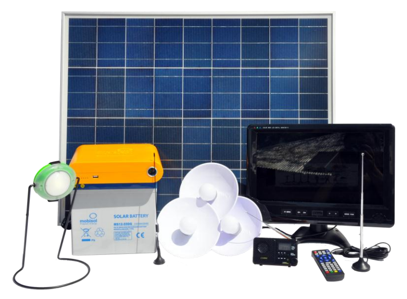
Mobisol 80Wp PAYG Solar Home System (Mobisol GmbH)

End-user financing is particularly important for large solar home systems targeting the energy poor given the higher retail price as compared to pico systems—$200–400 for large DC-only systems and $500–1,000 for versions that include an inverter to use AC appliances. Over 3 million large solar home systems have been sold in Bangladesh in the past 10 years, predominantly through 3–5 year loans to off-grid consumers offered by microfinance institutions (MFIs) and nongovernmental organizations. Two companies delivering large solar home systems on a PAYG basis leveraging digital finance are Mobisol (Kenya, Tanzania, Rwanda) and Simpa Networks (India). Both companies offer up to 2–3 year financing to end-consumers sold through a network of sales and service points.