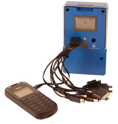
SoLite3 PAYG light (Angaza Design, Inc.)

Angaza Design (Kenya, Tanzania) and divi Power (Namibia, Kenya, Ghana, Somaliland, Peru) are two companies that have recently developed portable solar lights that off-grid consumers can pay off over 3–12 months through a combination of point-of-sale financing, mobile payments, and PAYG pricing. These and other portable solar light examples will be analyzed in the following sections.