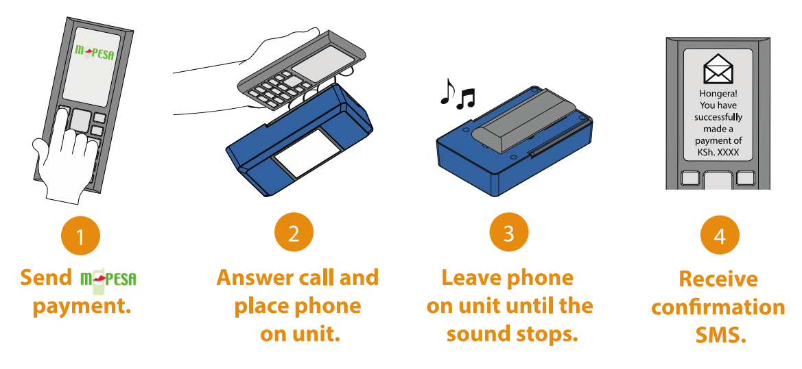
Loading proof-of-payment to the SoLite3 product (Angaza Design, Inc.)

For some Angaza Design products, upon receipt of a mobile payment, the company's software initiates a voice call to the end-customer's registered mobile number, which the customer then holds next to the PAYG product to communicate proof-of-payment and usage authorization data via audio tones.