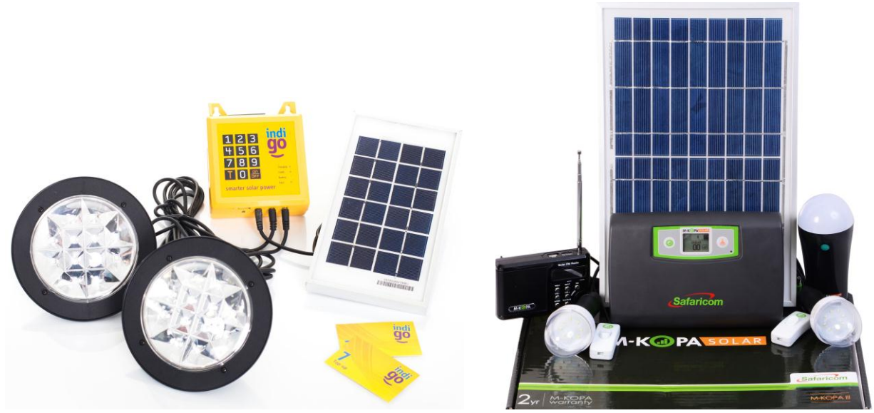
'Indigo Duo' (Azuri Technologies)

Solar pico systems can be described as "plug-and-play" because the end-customer does not require any specialized tools to connect, disconnect, or move the system and its appliances, and they are often self-installable by the end-customer. They are small in size and sold out of a single product container typically the size of a shoebox. These qualities make it possible to push pico systems through consumer electronics retail and fast-moving consumer goods distribution channels in much the same way solar lanterns are now distributed. Typically retailed at $80–150, these products are roughly the equivalent of one year's expenditure on kerosene and mobile charging fees for an average African consumer. However, uptake has been slow due to limited financing available to energy poor consumers. In East and West Africa, M-KOPA Solar and Azuri Technologies sell pico solar systems on a PAYG basis, financed over 12–18 months, which include 3–4 lights, mobile charging capabilities, and the ability to power one or more small DC appliances.