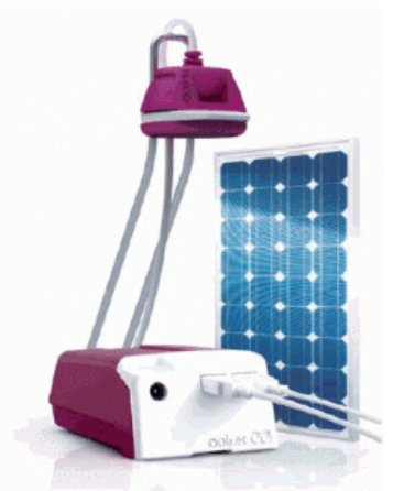
Oolux PAYG light