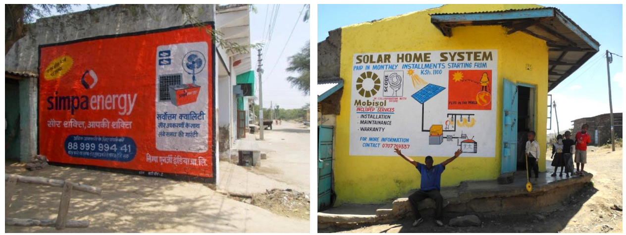
Simpa ad: Uttar Pradesh, India (Simpa Networks, Inc.)

PAYG companies borrow multiple marketing tactics from the prepaid mobile sector. Above-theline marketing activities for PAYG solar often involve painting buildings/homes with the energy brand/offering. Below-the-line marketing and promotions are facilitated by commission-based payment agents, field-based staff, and customer referrals. PAYG solar companies are also starting to deploy a range of direct marketing activities via SMS, phone calls, and targeted customer incentives. As with prepaid mobile airtime and mobile money services, smart agent incentives are critical to both drive signup of new customers and, more importantly, grow usage of PAYG energy services.