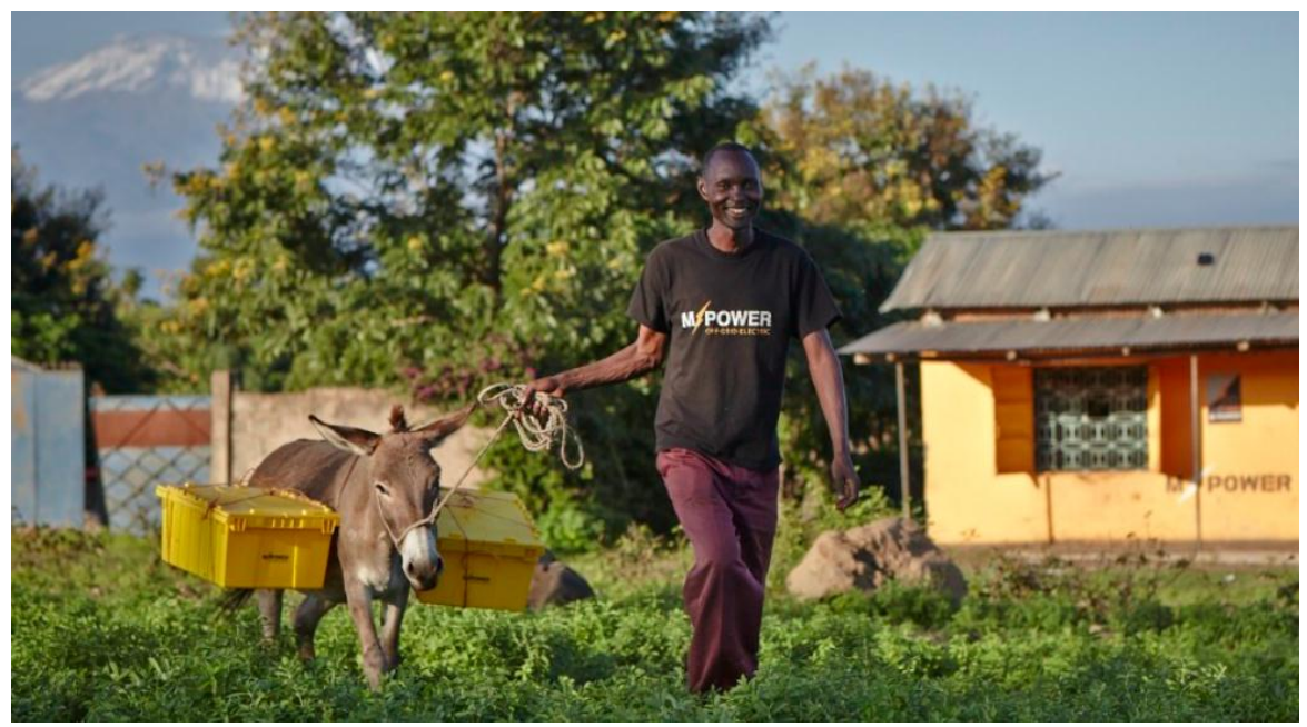
Last-mile distribution - Off-Grid:Electric, Tanzania

Most PAYG companies generate sales leads and deliver products through a network of commission-based agents, often with some form of physical presence in or near target off-grid areas, such as retail shops, supermarkets, cafes, and mobile phone shops. These agents play a number of roles depending on the company, but they generally serve as an initial marketing point where customers can learn about the products and pricing, fill out an initial application and make a down payment/deposit, and in some cases receive their product and bring it back for servicing. In markets where mobile money is not yet prevalent, these agents also often collect cash from customers and process proof-of-payment with the PAYG energy company via SMS. These agents also act as a distribution point, receiving products from the PAYG company, delivering to the end-customer, or installing at their premises, and might maintain a small inventory to reduce delivery times.