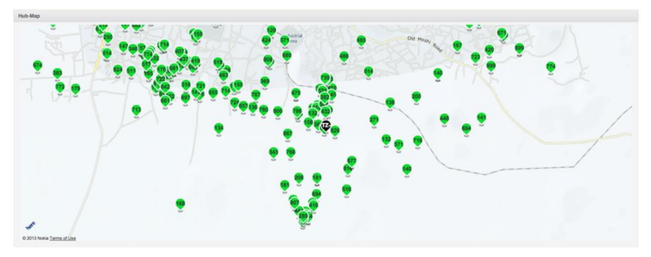
Mobisol Software Platform: System Map (Mobisol GmbH)

proprietary software, often hosted in the cloud, to track data related to end-customers and payments. These software platforms often include an SMS or data gateway for automated communication with products, customers, and agents, and some integration with a digital payment platform to receive mobile payments from customers. Some PAYG solar products (M-KOPA, Mobisol) track information on product performance (i.e., solar panel and battery voltage) and customer usage, sending data back to the central software hub on regular intervals via the GSM network.